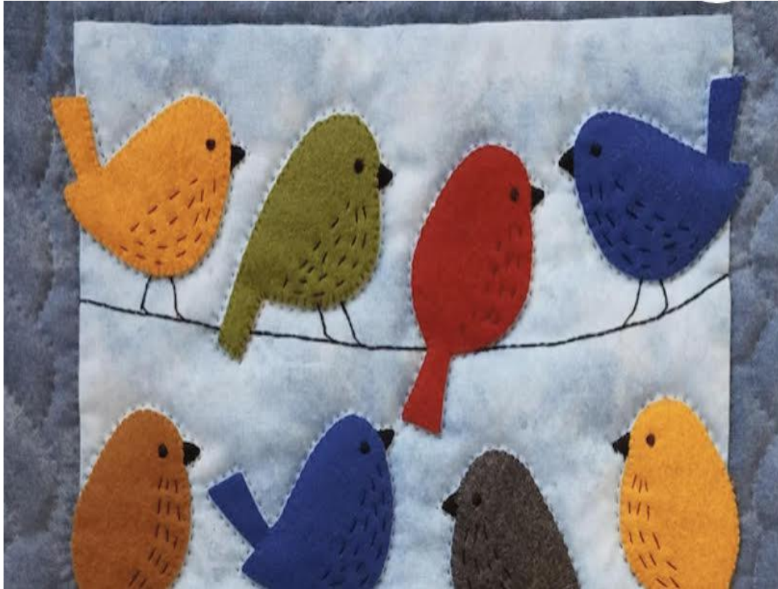
Wool Appliqué Patterns by Rachel Pelman Designs