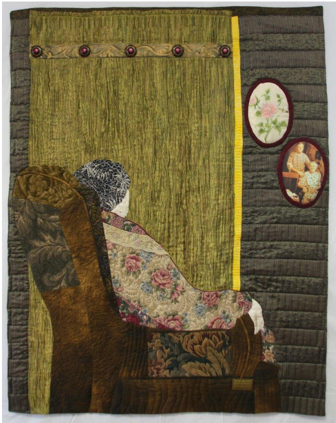
Wall Hanging Millie Cumming