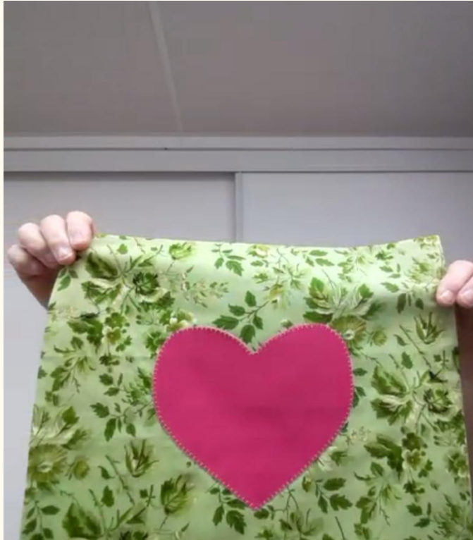
Pillows for Heart Patients