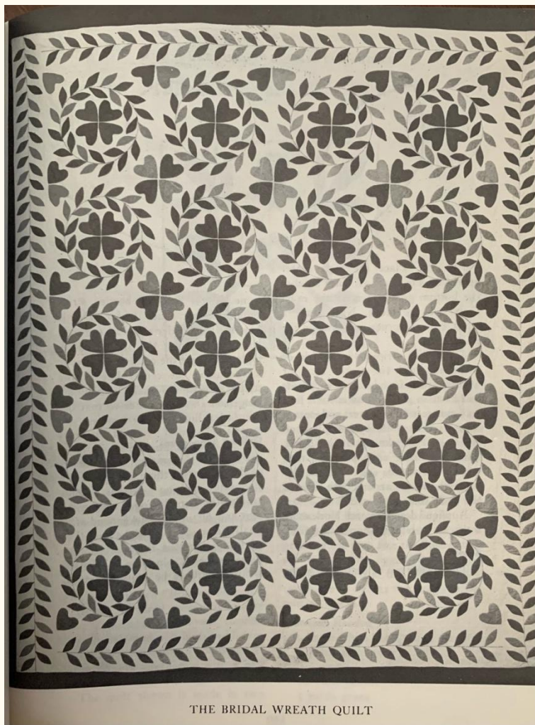
THE BRIDAL WREATH QUILT

Fold the block diagonally each way and crease by pressing with a