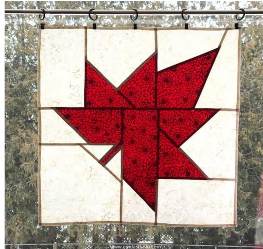
Oh Canada Quilt Along Maple Leaf Pattern.